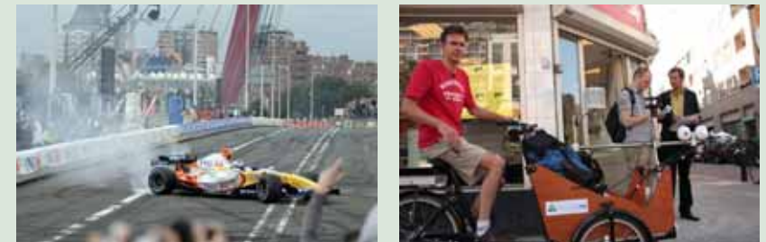
Illustrations: City Racing and research for 'heat islands' in August 2009 in Rotterdam.