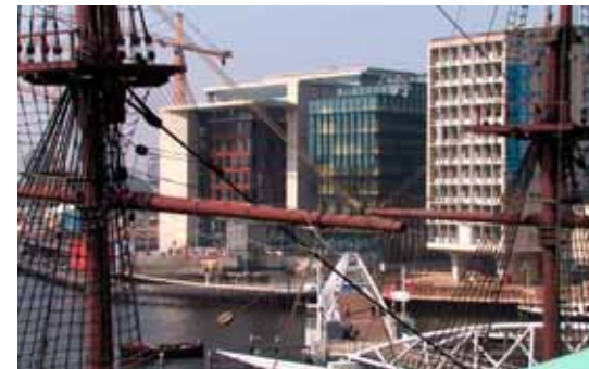
Illustrations: The Oosterdokseiland is one of the metropolitan projects with which Amsterdam presents itself as a leading city in sustainability (Bouwfonds MAB Ontwikkeling, Erick van Egeraat Architects, CIID Visualisations).