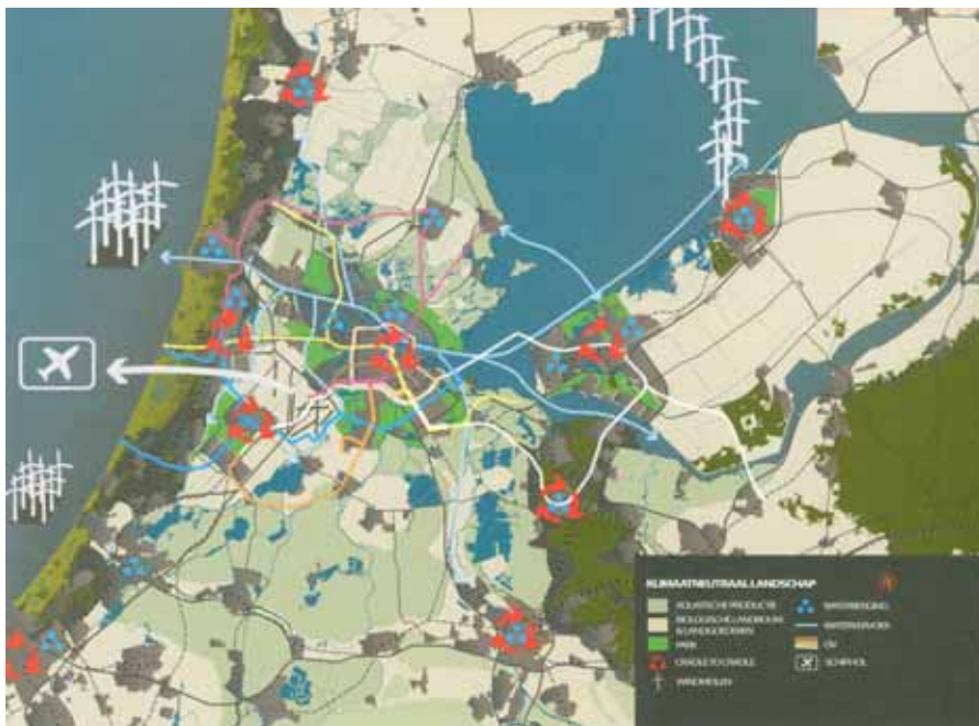
Illustration: The Climate Neutral Region, one of the perspectives for the Amsterdam Metropolitan Area (Development Scenario 2040 Amsterdam Metropolitan Area, 2008).

The road to Low Carbon Cities goes through Low Carbon Regions. The case of Energy Valley makes perfectly clear that in The Netherlands the size and scale of a region offer more opportunities than the size and the scale of a city. It justifies the questions whether the policies for 40% reduction in CO 2 emissions in 2025 (Amsterdam), 50% reduction in CO 2 emissions in 2025 (Rotterdam) or becoming climate neutral in 2050 (The Hague) make sense without a regional context. Looking for the answers