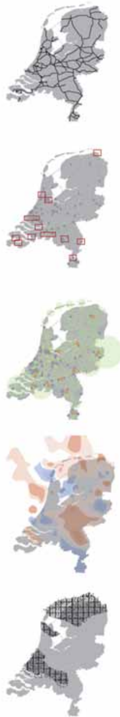
Illustration: The Netherlands becoming CO 2 -neutral according to Posad and Except is the result of many different projects like exchanging waste heat in industrial areas and using geothermal energy (Posad and Except, 2009).

In May 2009, at the request of the Ministry of Housing, Spatial Planning and the Environment (VROM), the agencies Posad and Except published the strategic study 'CO 2 2040', on the Netherlands becoming CO 2 neutral by 2040 [9]. The study indicates that the measures the Netherlands will take to become CO 2 neutral within thirty years, will have to be far more wide-reaching and far more radical than they are at present. Firstly, we need to make clear how much energy we - society, households and individuals - actually consume and how much CO 2 we produce. The study also demonstrates that the serious objective of achieving a CO 2 neutral built environment will require far more than merely the application of standard measures and technologies such as lowering the EPC of individual (new) houses. Spatial planning and the choice of locations for functions and buildings must be geared to a far more intensive and intelligent use of residual heat and geothermic conditions in urban areas. In addition, the study calls for a revolution in the field of public transport. As an example, they point to the scope and the reliability of the metro network in Stockholm compared to the public transport network in Dutch urban regions.