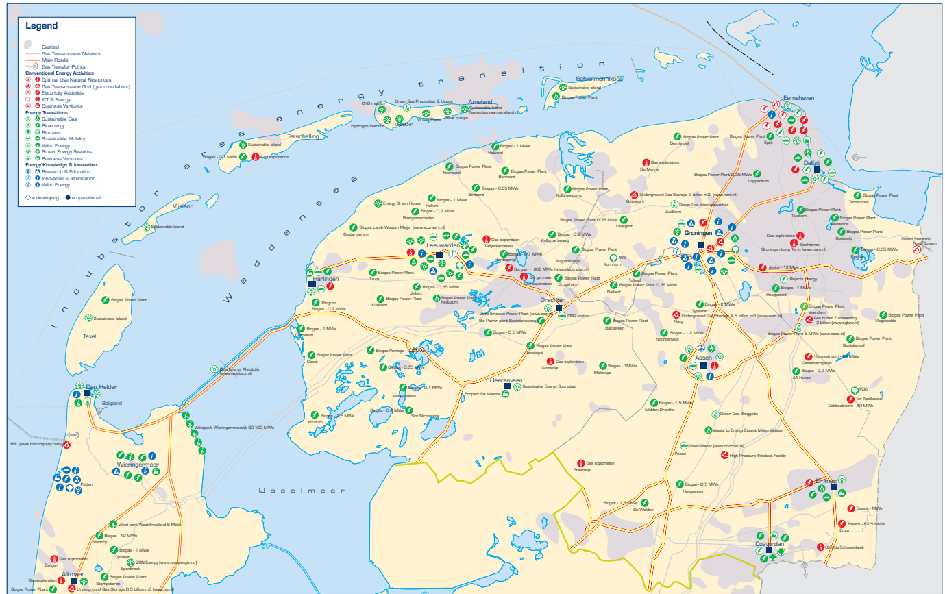
Illustration: The Energy Valley Region

the High Efficiency Boiler and the development of a Smart Power Grid. The High Efficiency Boiler is a steam producing central-heating boiler which, compared to current technologies, gives a saving on energy costs and which can achieve a substantial reduction in CO 2 emissions. The Smart Power Grid is an intelligent and fine-meshed electricity network that links energy generators and energy consumers. The Energy Valley is involved in the development of applications for the Smart Power Grid, tests them in practice and deploys them on a large scale in five large housing estates.