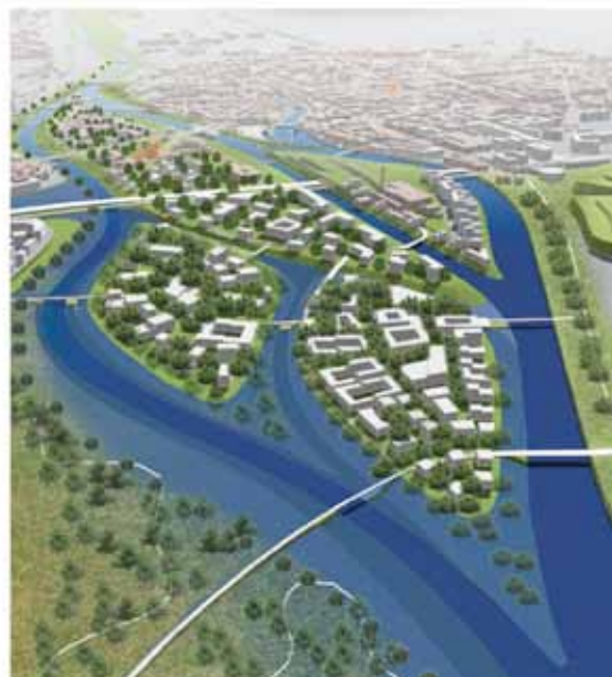
The Dutch office Kuipercompagnons advised to reopen and reuse former riverbeds of the river Warta for water catchment. The illustrations show low and high water level.