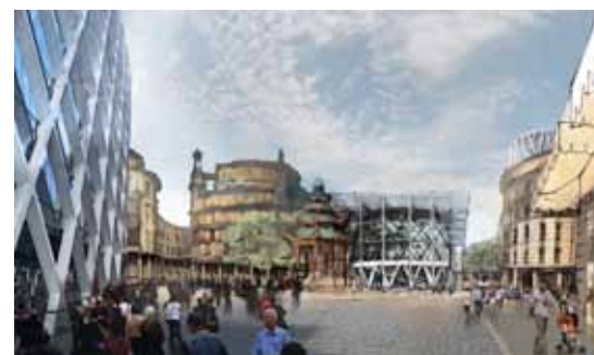
Downtown Shantou. Existing situation and sketches for development. After the ISOCARP congresses in 2008 and 2011 the Chinese cities of Wuhan, Shantou and Nanjing invited Urban Planning Advisory Teams to contribute strategic advice in large-scale urban planning projects.

even get jobs because of their active involvement in our activities. All we have to do, as ISOCARP, is to establish a worldwide network of ambitious and talented young planners, stimulate them to learn from the mistakes of previous generations of planners, and to think independently like we did when we came into the profession ourselves.'