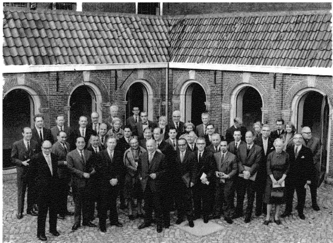
ISOCARP was founded in Amsterdam (The Netherlands) in 1965.

When the International Society of City and Regional Planners (ISOCARP) was founded in 1965, the population of western cities was increasing rapidly. It was also becoming clear that town and regional planners had tasks beyond housing and that good planning was important to stimulate economic development, manage social change and tackle environmental challenges. The inaugural congress was held in the Netherlands. In 2015 the congress will come home, exactly 50 years later. In the past five decades, ISOCARP has grown into a worldwide platform where planning professionals from all corners of the world and all ages and backgrounds share their knowledge, experience and passion for the planning profession.