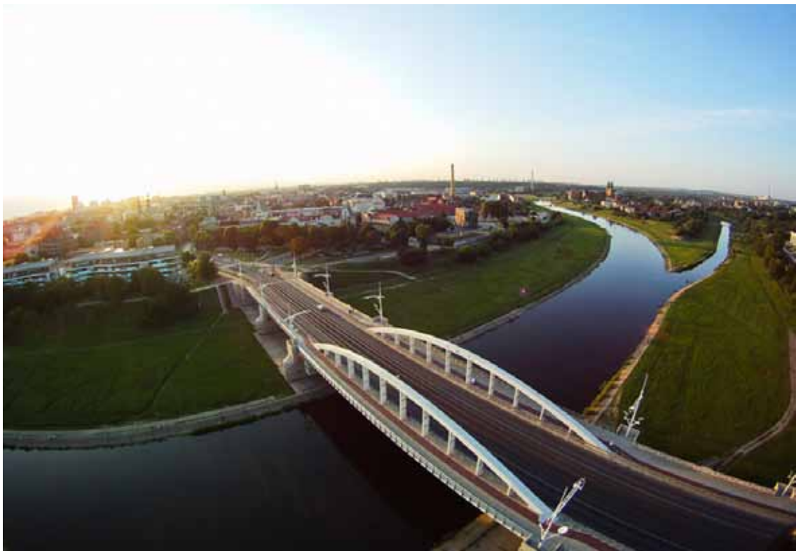
Existing situation in Poznan, Poland. Unusual heavy and continuous rainfall in Central Europe led to heavy flood-

ings. The urban transformations and the relationship between cities and water is the main theme of the next urban and