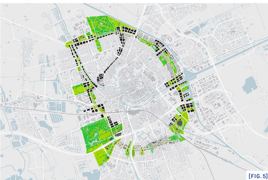
[FIG. 5] The networks of heat, electricity, and buffering can be combined with current ring road of Groningen. The ring structure forges the different urban districts together into a coherent urban environment, hence providing an urban development strategy for Groningen in the next decades.

social development and employment opportunities. Next to this, cities are the choice locations of productive, post-industrial and technological progress, entrepreneurship and creativity. Current preoccupations with climate change, mass migration and energy transition are constantly transforming both the urban landscape and the way that these cities can and need to be managed, planned and prepared for the future.