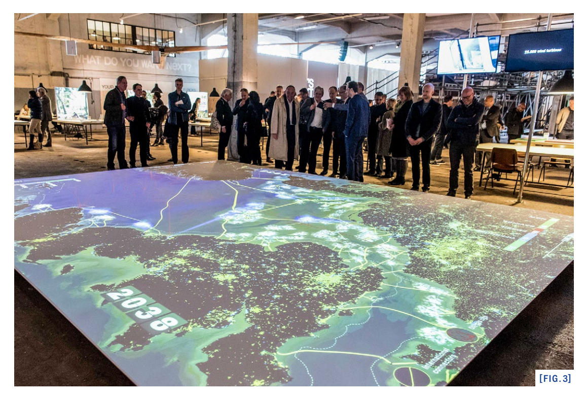
[FIG.1-3] Visitors experiencing the seventh edition of the International Architecture Biennale Rotterdam (IABR) 2016 visualizing the city of the future in the next economy.